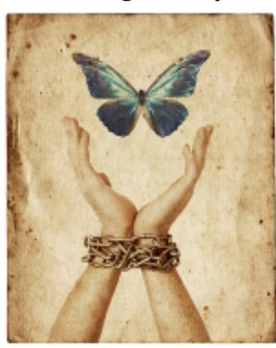
Creating Opportunities for Greater Well -Being

A Project Intercept Program 3315 Airway Drive Santa Rosa, CA 95403 Phone: 707.523.2242